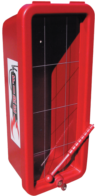
Cylinder lock/2 keys and hammer included