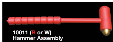
10011 (R or W) Hammer Assembly