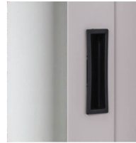
ADA "RECESSED" HANDLE