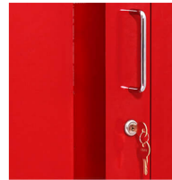
CHROME "D" HANDLE W/ SAFETY BREAK LOCK