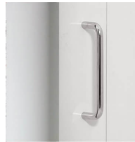
CHROME "D" HANDLE (STANDARD)