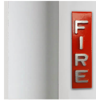
ALUMINUM DIE CAST RED "FIRE" HANDLE