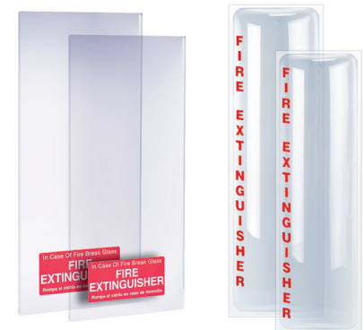
Classic Acrylic scored or unscored (decal sold separately)