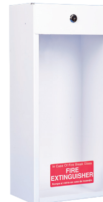
Classic Premium Series White