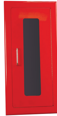
Red Coat Option ELITE Series