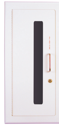
Vertical Duo (style 8) ELITE Series