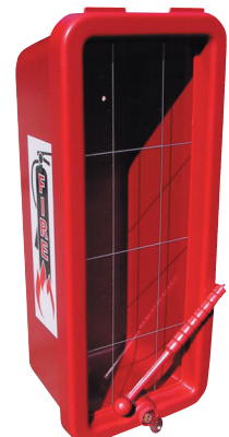
Plastic Cabinet Red or White