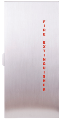
Full Metal (style 7) SONOMA Series