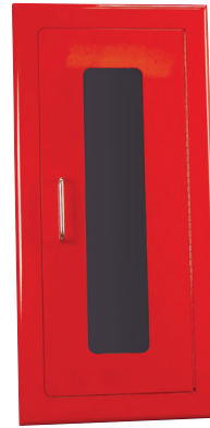
Red Coat Option ELITE Series