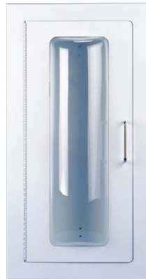
Bubble Canopy (BC)