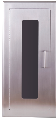
Full Glass (style 6) ELITE Series