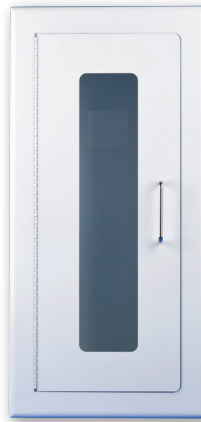
Full Glass (style 6) MURANO Series