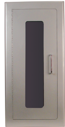
Aluminum Full Glass (style 6) TITAN Series